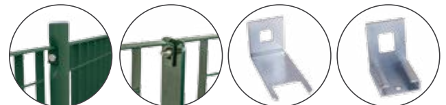
Squeezed round post Ø 50 mm