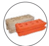
CLS & ABS bases with 38 mm holes